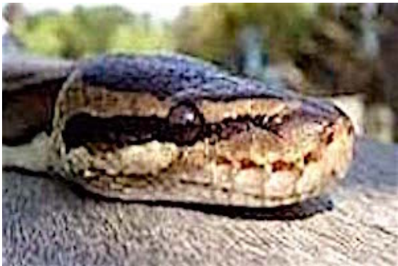
Showing the very sensitive infra-red heat receptors or pits along the upper labial scales.

As my snake was obviously not on display in any sense, as a zoo snake would be, and its presentation was thus not a consideration, I used several sheets of clean newspaper to cover the floor of its vivarium. Newspaper is absorbent and could be replaced quickly whenever necessary. The snake spent its time either in full view, coiled and wedged snugly between the rocks and cut branches, or largely hidden from view under the newspaper. It was fascinating that, over time, the snake learned how to use its snout to prod, slowly and methodically, along the straight outside edges of the newspaper until it found a loose or torn area. It then lifted the paper up and disappeared underneath. Bingo!